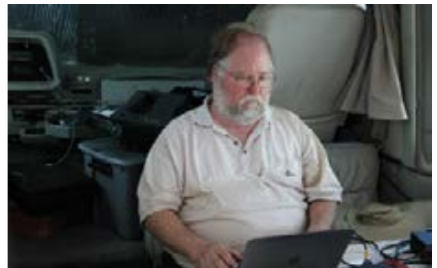
Single Side Band (Voice)