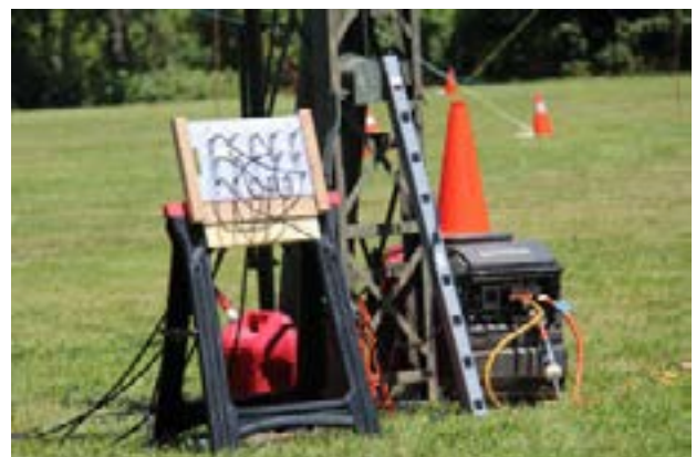
Got the switchboard, but no Lily Tomlin