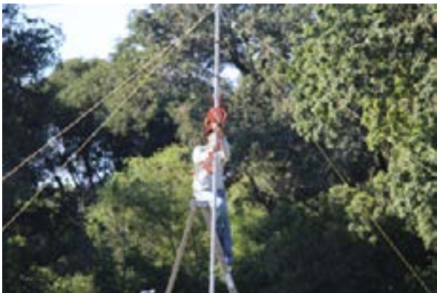
Friday - the antennas go up