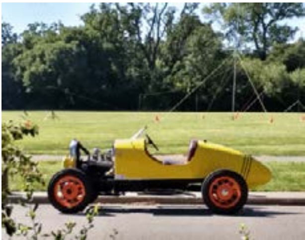
KG6JSL's Field Day Ride