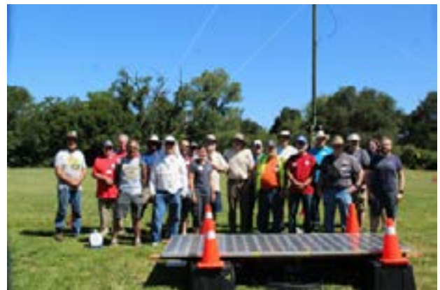
The "Before" picture