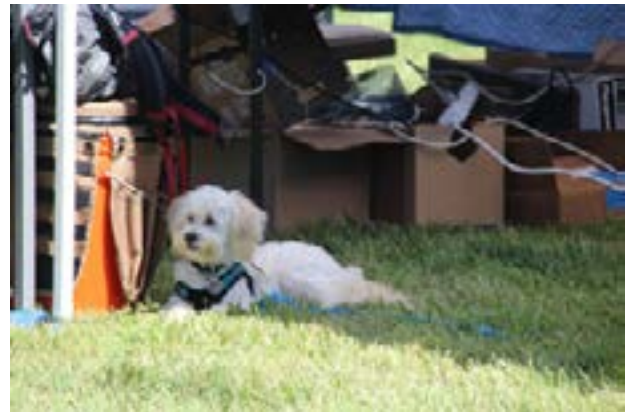
Dog Tired - The End