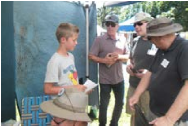
Got his license 10 mins. ago, making contacts on GOTA