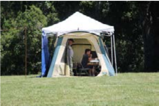
Shhh ... CW