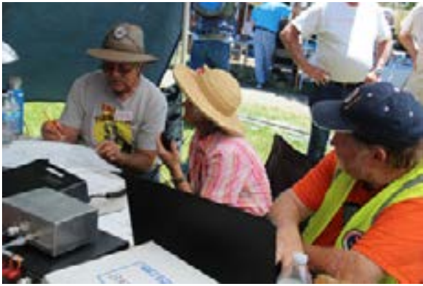
Get On The Air (GOTA)